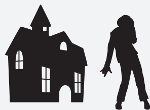
Place & Artists